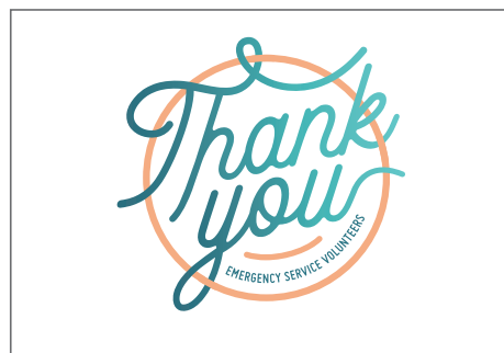
CHANGE OF COLOUR