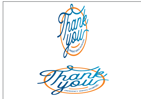
STRETCHED OR CONDENSED