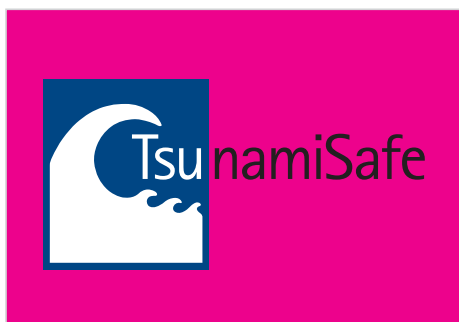
Vivid coloured background