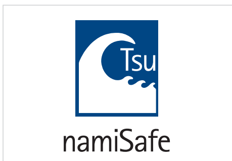
Altered or adjusted