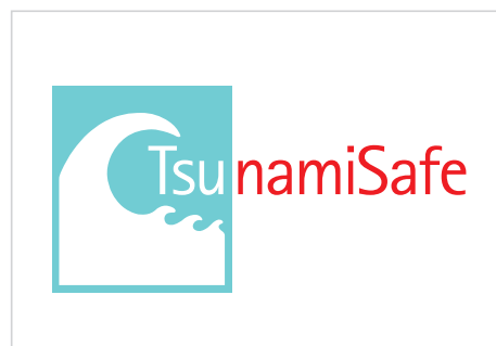
Change of colour